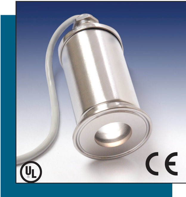
MetaClamp® with Lumiglas® Light