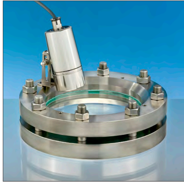
Application as combined sight and light port on a sight glass fitting acc. to DIN 28120, mounting by way of hinged bracket