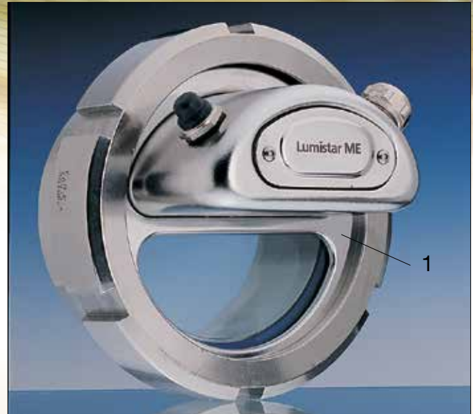
Complete unit of a Lumiglas light/screwed sight glass unit with luminaires type Lumistar ME