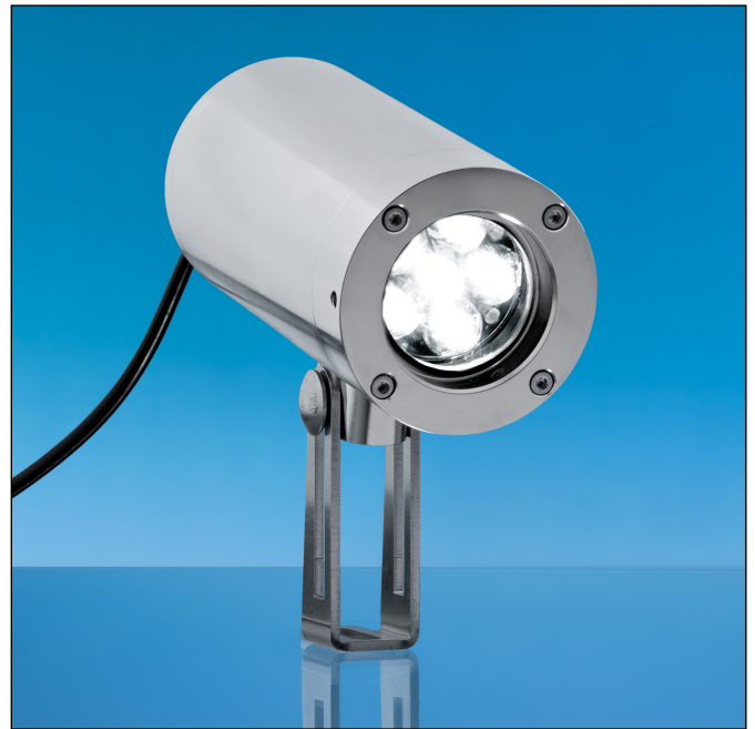
Lumistar luminaire ESL 55-LED-Ex