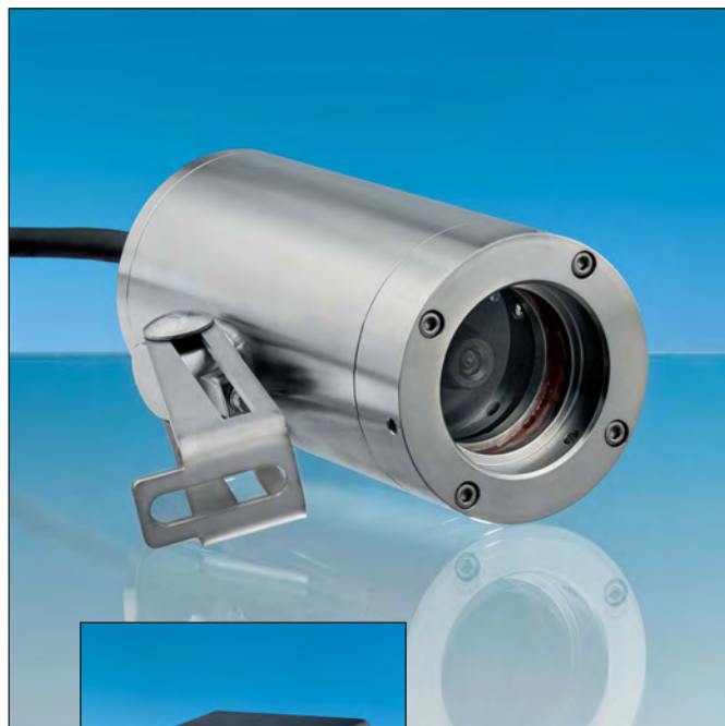
VISULEX camera K55P-Ex with fixed lens