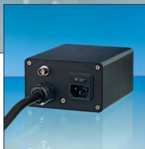
Terminal box for VISULEX camera K55P-Ex