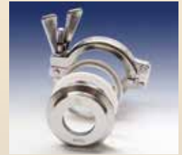
Type 80: MetaClamp® Sanitary Clamp Fitting