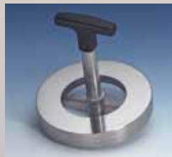
Type 73.SW: Sight Glass Discs with Wiper