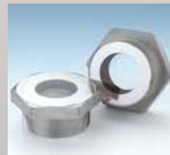
Type 61: Threaded Sight Glasses - Hexagon head, NPT or other threads