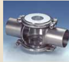
Type 99.TUC: Sight Glass with Luminaire for Varivent-In-Line Fittings