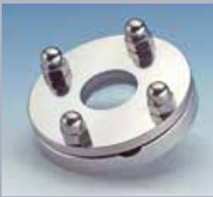
Type 99.NA: Sight Glasses for Flush Mount Hygienic Weld Pad