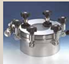
Type 99.ZIM: Pressure Manway with Integrated Metaglas