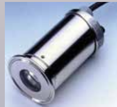
Type 80.USL33: MetaClamp® Sanitary Clamp Fitting with USL-33 Luminaire