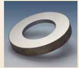
Type 76: Sight Glass Discs for ANSI Flange connection