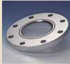
Type 19.BIO: Bolt On Sight Glass for Sterile Applications O-Ring Seal