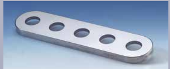
Type 99.LSG: Fused Metal Elongated Sight Glass for Rectangular & Obround Sight Windows and Armored Liquid Level Gages