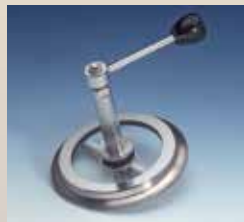
Type 80.SW: MetaClamp® - with Wiper