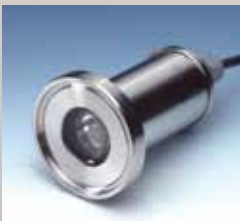
Type 83.USL33: Sight Glass Discs for Aseptic Screwed Pipe Connection DIN 11864-1 for Mounting Luminaires USL-33