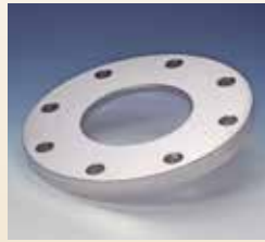
Type 13: Sight Glass for ANSI Flange Connection type full face