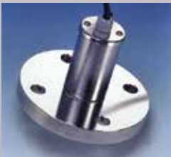
Type 19.BIO.USL33: Bolt On Sight Glass for Sterile Applications using Sight Glass Luminaires or USL-33