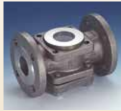
Type 77: Sight Glass Discs for Visual Flow Indicator Fittings