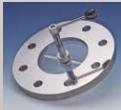
Type 13.SW: Sight Glass Flange - with Wiper