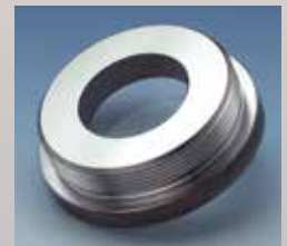
Type 64: Threaded Sight Glasses - Round head