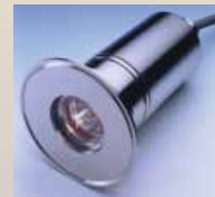
Type 80.ESL25: Sight Glasses for Use with Clamp Connections and Sight Glass Luminaire ESL-25 EX