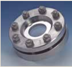
Type 73: Sight Glass Discs for DIN 28120 and other weld type assemblies