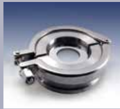
Type 80.TCI.CC: Sight Glasses for Clamp Style Flush Mount