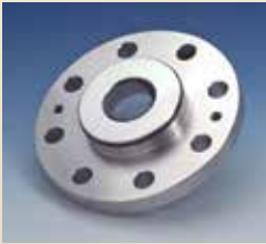
Type 903: Sight Glass Discs for Sterile Applications, stepped for flush mount