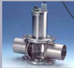
Type 99.TUC.USL33: Sight Glass with USL-33 Luminaire for Varivent-In-Line Fittings