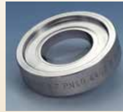
Type 74: Sight Glass Discs with Tongue and Groove Joint