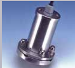
Type 99.NA.USL33: Sight Glasses for NA-Connect Fitting with USL-33