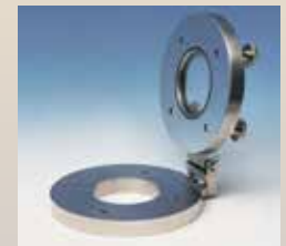
Type 80.SC: High Pressure Hinged with O-Ring Seal