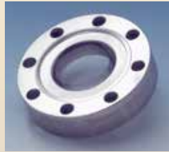
Type 19.CF: Sight Glass Discs for ConFlat high vacuum applications