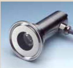
Type 80.USL01: MetaClamp® Sanitary Clamp Fitting with USL-01 Luminaire