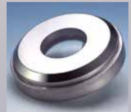
Type 83: Sight Glass Discs for Aseptic Screwed Pipe Connection DIN 11864