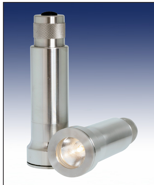
Cordless LED Light Series FLBP-LED for Portable Vessels