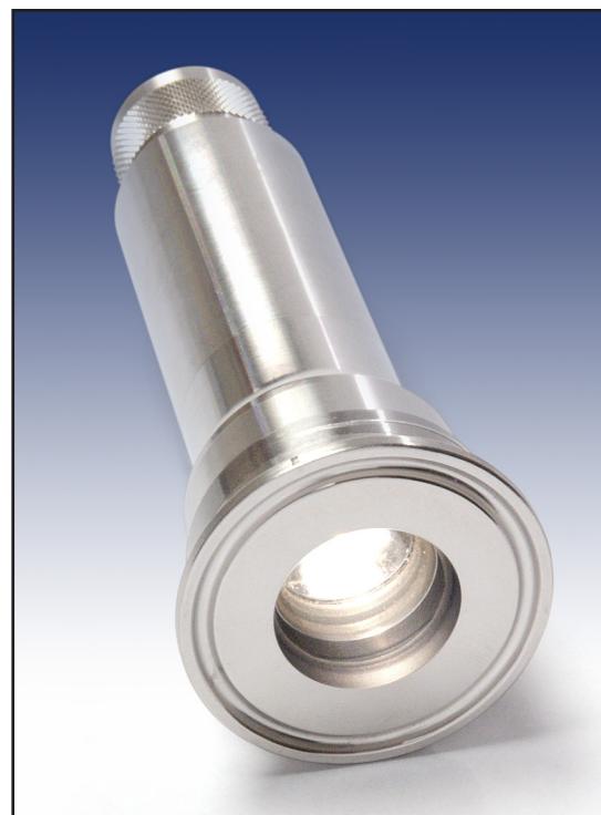
Cordless Light with MetaClamp Sanitary Connection