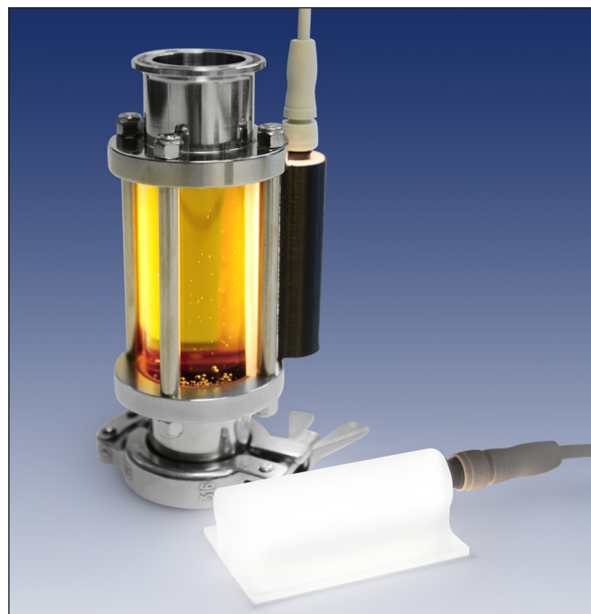
LumiFlo Light Mounted On Sanitary Inline Sight Glass