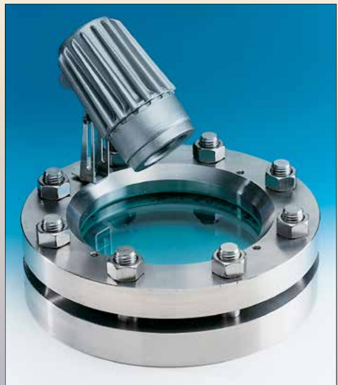
Lumiglas luminaire USL 05, pivoted back off the sightglass