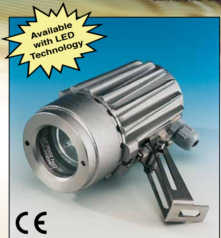
Lumiglas luminaire USL 05 with hinged bracket