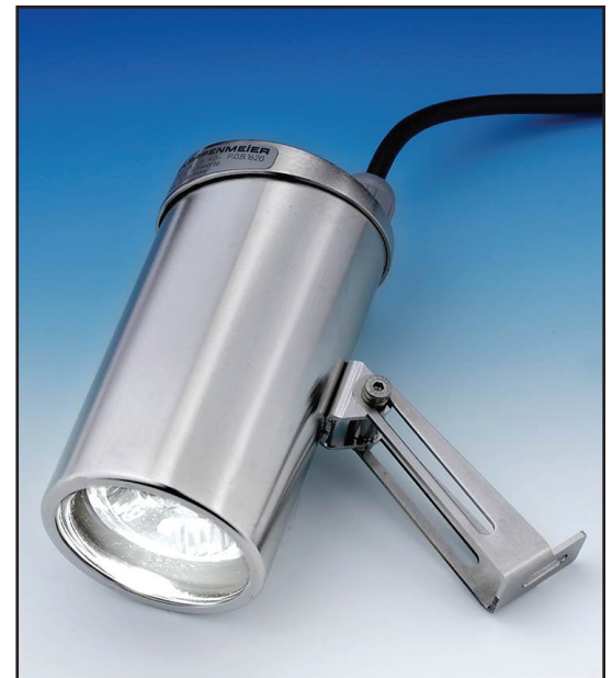
LumiStar2000 Luminaire Series USL15 with Mounting Bracket