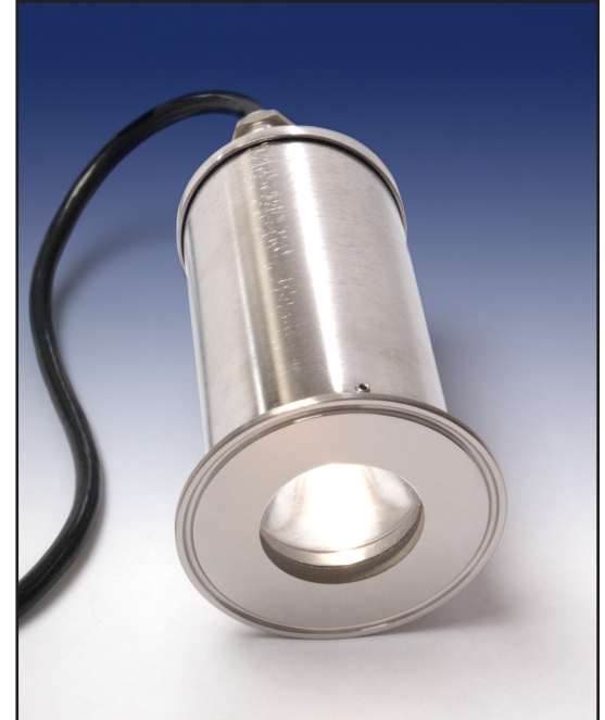
LumiStar2000 Luminaire Series USL35 with MetaClamp® Sanitary Clamp Connection